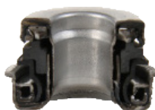
(Cartridge seal in cross section)

The tool compresses the seal by about 2-3 mm and you then press the seal down into the right position, see figure 3. Once the seal is assembled, the longitudinal position of the shaft must not change. Remember that the counterhold must be placed on the shaft when the impeller is fitted. The tool and seal are shown in cross section.